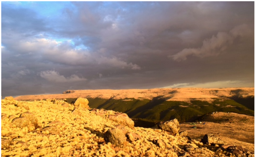
The Ethiopian landscape